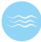
Debilitating vaginal discharge