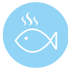
Unpleasant vaginal fish-like odour